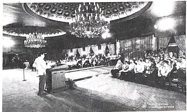
President Rodrigo Roa Duterte delivers his speech after administering the oath to newly-appointed officials from various government agencies during a ceremony at the Malacañan Palace on February 7, 2019.